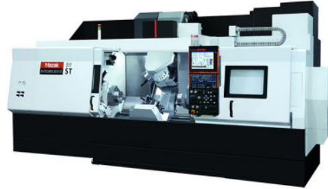
(3) Mazak INTEGREX 200IV ST 60" Turning – Main and Sub Spindle Fully Integrated 9 Axis Mill/Turn Machining