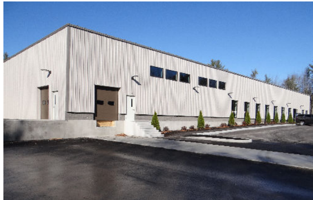
25,000 Square Foot Addition opening late 2023

Our new 40,000 square foot Nikel Precision Group facility in Saco ME.