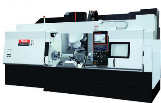
(1) Mazak INTEGREX 300III ST 60" Turning – Main and Sub Spindle Fully Integrated 9 Axis Mill/Turn Machining - 6 Ft Bar Feeder